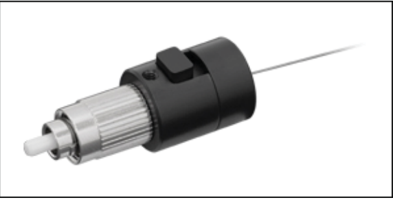
Click for Exploded View The BFTU terminator secures the connector using a 2-56 setscrew and the fiber using a spring-loaded button-actuated clamp.

For applications where a temporary fiber termination is desired, our BFTU Bare Fiber Terminator is the solution. The bare fiber terminator is designed to hold fibers in standard connectors (sold separately). The back of the connector is held in place using a 2-56 setscrew, while the fiber is secured with a spring-loaded, button-actuated clamp (see photo to the right).